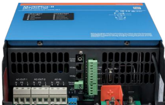
Connection Area MultiPlus-II 3k