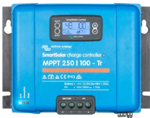
SmartSolar Charge Controller MPPT 250/100-Tr with pluggable display